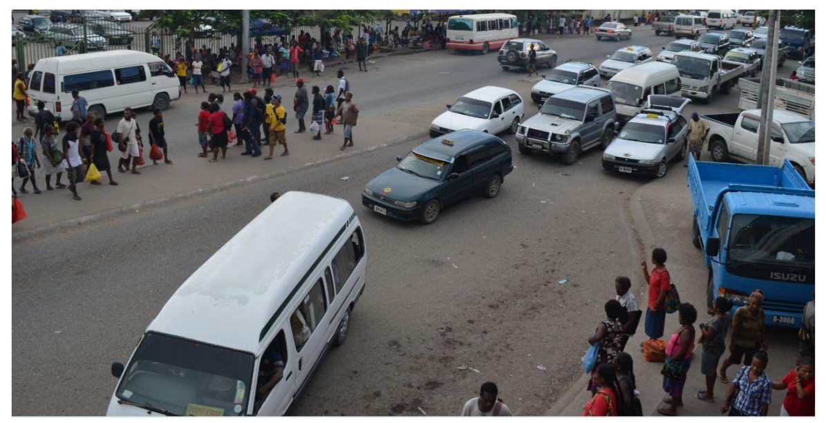
Frequent bus stop-and-goes that usually create traffic congestion along the road in Honiara