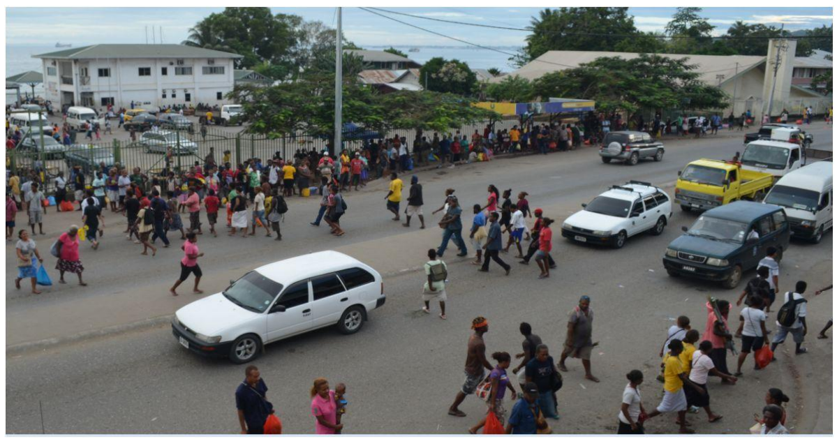
Pedestrian Crossing at the Honiara Central Market holds up flow of traffic

Pedestrians also contributed a lot in road congestions. In his submission, Mr Biti revealed that unnecessary crossings and careless attitude of pedestrians walking along the side of main roads have resulted in traffic congestions. <sup>71</sup>