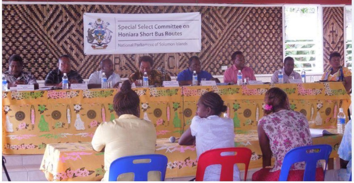
Special Select Committee Public Hearing –Central Honiara Constituency