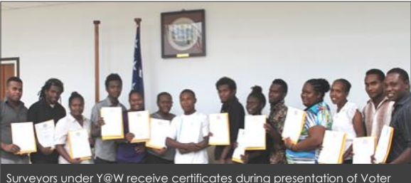
Surveyors under Y@W receive certificates during presentation of Voter Behavior Survey report at Paul Tovua complex (PTC)