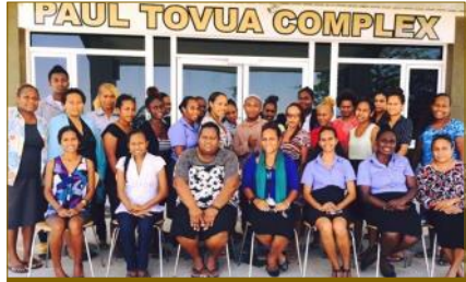
Second group meeting photo in May 2015

A forum where young women and men coming from various fields in public, private and voluntary, experience and take part in leadership.