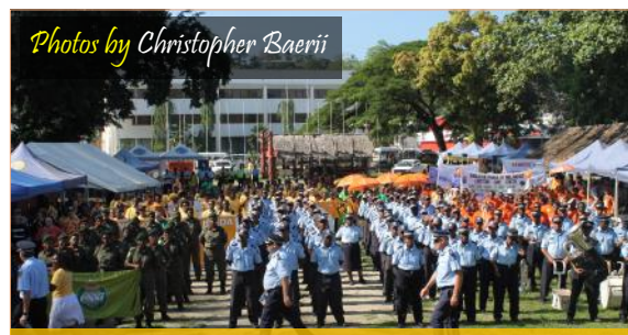
16 Days Activism march ends at Art Gallery, It was from 27 Nov-10 Dec 2015

YWPG has been a strong supporter for ending violence against women and girls.