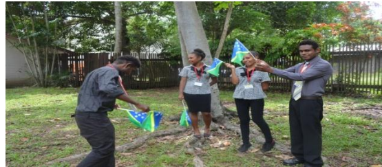
The Solomon Team taking it on easy; while waiting for the debate to start outside the Moresby Arts Theater.