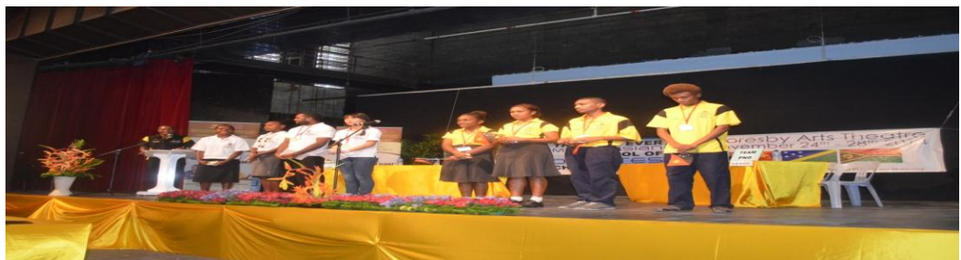
Round Two begins with Team Papua New Guinea taking on Team Vanuatu.