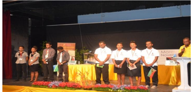
Before the debate begins, the audience was entertained by the “One Love Band” from South Africa – Late Lucky Dube’s vocals. Then the Line up for Round One – Solomon Vs Vaunatu.