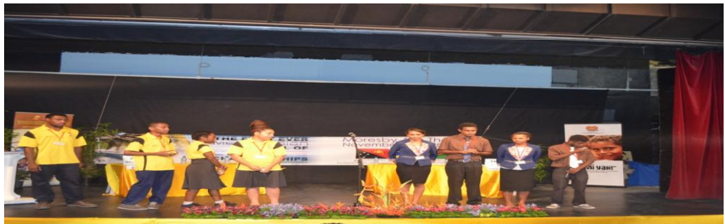
Round Three Team Solomon Taking on Team Papua New Guinea.